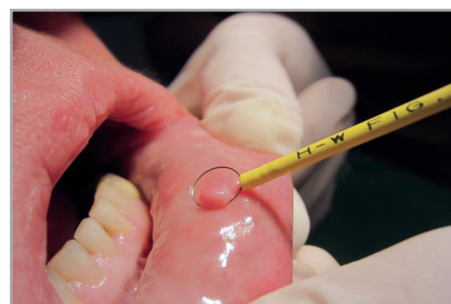
Fig. 5: Removal of a fibroma from the lower lip.

In most of the cases I have treated with the hf Surg, there was no need for sutures, as I was able to perform direct coagulation. The shortened treatment time is beneficial to the clinician and patient, particularly in the case of surgically demanding procedures. Compared with other methods, the duration of healing is shorter as well, often completed after 72 hours. The painless treatment and the aesthetic result too are pleasing for both the patient and clinician. In summary, the maintenance of the tissue turgor and necrosis-free cutting with simultaneous optional coagulation allows better and faster treatment. The small and handy unit permits easy transfer between different treatment rooms. Before the hf Surg became an integral part of my everyday practice, I had doubts, but these were allayed after a personal demonstration and my subsequent use of the device.