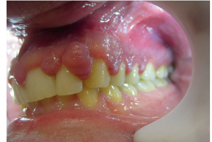
Fig. 1: Preoperative diagnosis: a patient with gingival hyperplasia.

Moreover, the hf Surg has a coagulation capability, which allows cutting and stemming of bleeding simultaneously. The operating area stays free of blood and an unobstructed field of view is maintained for fast treatment. Some of the indications for which this