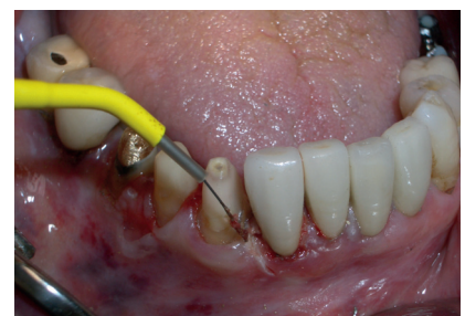
Fig. 3: Exposure of the preparation margin prior to impression taking.