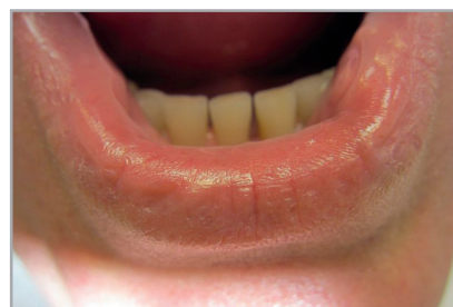
Fig. 6: Results three days after surgery.