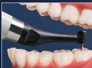
CanalPro X-Move contra angle super mini-head & slim neck