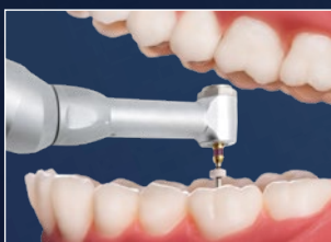
Normal contra angle head & neck